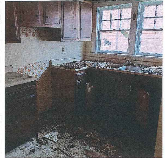
Needed Kitchen Repairs and Updates