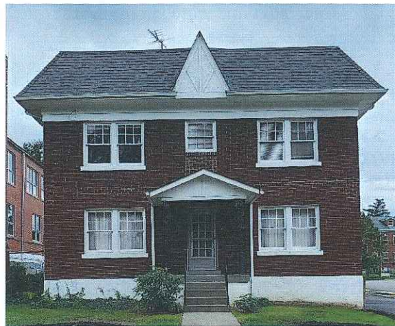
Future St. Anne's House